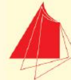
Hochschule Karlsruhe Technik und Wirtschaft UNIVERSITY OF APPLIED SCIENCES

In 2008-2009 the Technical University of Moldova and in collaboration with Karlsruhe University of Applied Sciences had applied application on Development of a High Capacity Real-Time GNSS Positioning Service using new RTCM 3.1 transformation messages that can be integrated in MOLDPOS - Project launched by Agency for Land Relations and Cadastre (ARLC) funded by Norwegian Government.