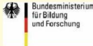
Federal Ministry of Education and Research of Germany

Bilateral Research Program to fund 1 year projects.